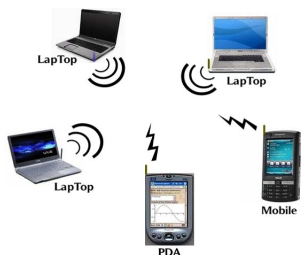
Figure 1.1 Mobile Ad Hoc Wireless Networks

As ad-hoc and sensor networks become a growing part of our everyday life, they could become a threat if security is not considered carefully before deployment. There are several security goals in ad-hoc networks. The provision of authentication is a core requirement for secure and trustworthy communication in ad-hoc networks, and it is the focus of this work. Only if there is efficient authentication available in ad-hoc networks, secure protocols and applications can be designed. IT security is the enabler for innovative applications, and provision of authentication is the enabler of security. The security issues for ad-hoc and sensor networks are different than the ones for fixed traditional networks such as local area networks (LANs) and wide area networks (WANs). Mobile ad hoc networks are different from mobile wireless IP networks in that there are no base stations, wireless switches, and infrastructure services like naming, routing, certificate authorities, etc. Because mobile nodes join and leave the network dynamically, sometimes even without a notice, and move dynamically, network topology and administrative domain membership can change rapidly. Thus it is important to provide security services such as availability, confidentiality, authentication [3, 4], access control, integrity, and non-repudiation.